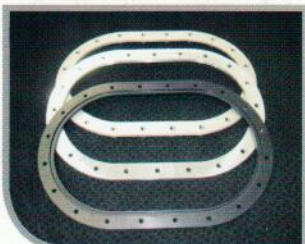
Clear Anodized, Alodine, Black Anodized