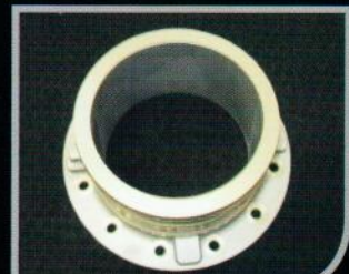
6" LAT Can be cast with integrated plate