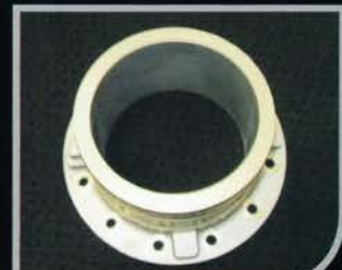
6" LAT Can be cast with integrated plate