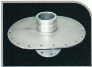
4" Access Plate 1 integrated casting