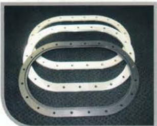
Clear Anodized, Alodine, Black Anodized